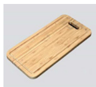
B20.42 chopping board