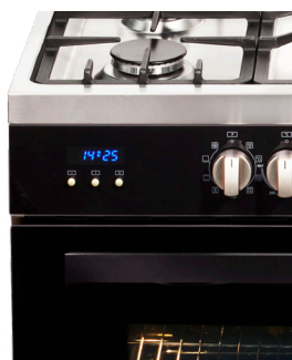
BRUSHED MATT BLACK HANDLE