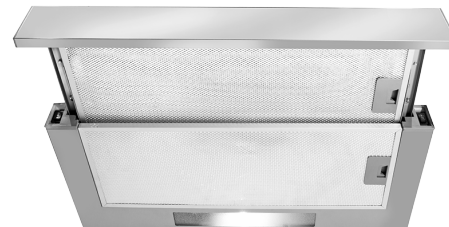
60cm image shown