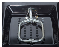
Oven Gas Burner