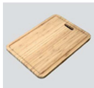
B30.42 chopping board