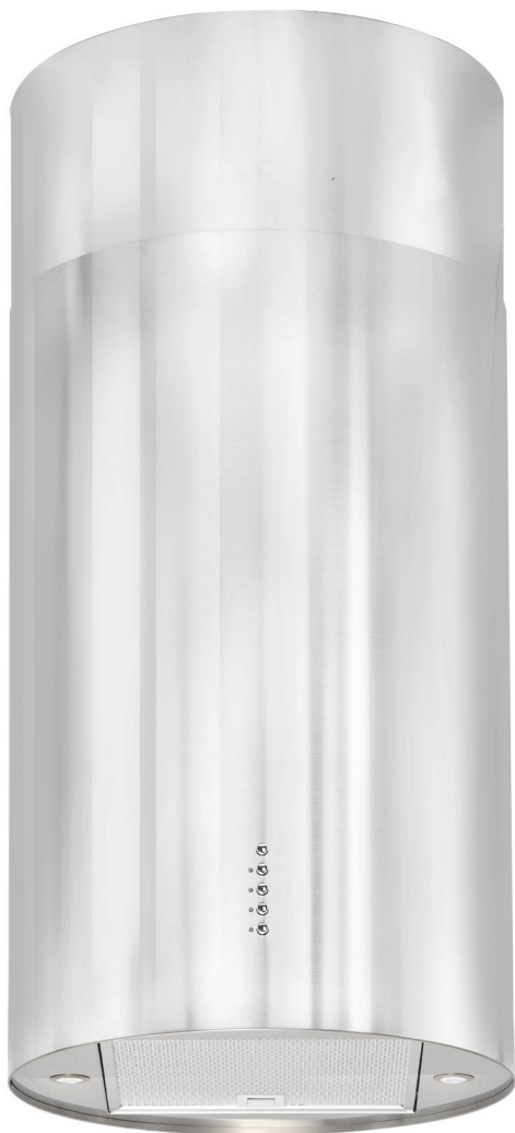
Pictured: • X370 Island Hood

ILVE's Island range hoods are designed to stealthily keep your kitchen fresher and cleaner. We all adore the scrumptious smells that billow from your favourite dishes in the kitchen, but not when those smells become stagnant within the home. ILVE's rangehoods are designed to stealthily keep your kitchen fresher and cleaner. Their powerful high speed fan removes cooking odours, smoke and vapour from the kitchen, while extremely fine filters trap all grime. It features intelligent features like the new ECO-booster, auto fire shut-down sensors and a filter cleaning reminder light. The smart timer function can be set for an automatic turn off leaving you to your culinary masterpiece at hand. In-built LED Lights produce a natural brightness, illuminating your cooking area while the streamlined electronic control panel ensures whisper quiet air extraction is at your fingertips. Either as a visual focal point or discreetly integrated, it is easy to see that ILVE Rangehood's are built to extract!