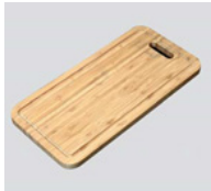
B20.42 chopping board