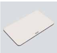
G21.40 white chopping board