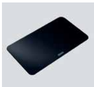
G21.40 black chopping board