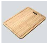
B30.42 chopping board