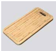
B20.42 chopping board