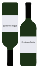
Capacity based on Bordeaux Bottles