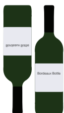
Capacity based on Bordeaux Bottles