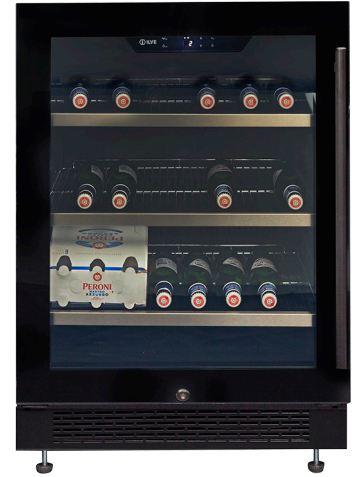
Left hand hinge pictured