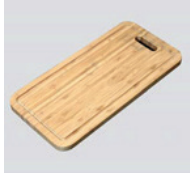
B20.42 chopping board