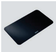
G21.40 black chopping board