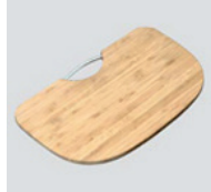
B32.34 chopping board