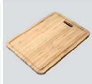
B30.42 chopping board