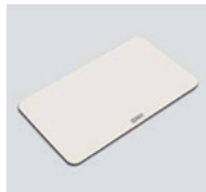
G21.40 white chopping board