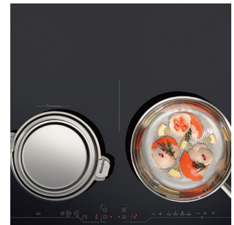
Limitless cooking possibilities