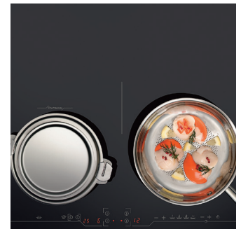
Limitless cooking possibilities