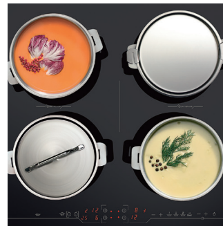
Freedom of Expression